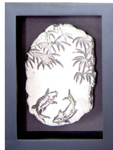
"Koi Pond in Bamboo" Jo-Michele Boyer-Sebern