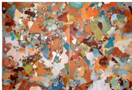
"Universal Truths" 2006 Oil & Mixed Media on Canvas Diptych, 2 @ 48" x 36"

"My work is deeply inspired by the Abstract Expressionist and other modern art movements. I am seeking to produce art that expresses our spiritual connection to nature and the physical feeling of being alive, without the invocation of religion or use of iconographic content. Visually appealing, energetic and alive, my work conveys energy and harmony, flow and solidity, light and mystery connecting the viewer to those parts of their human experience." www.abstract-expressionist.com