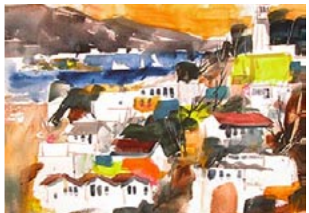
Coit Tower, San Francisco