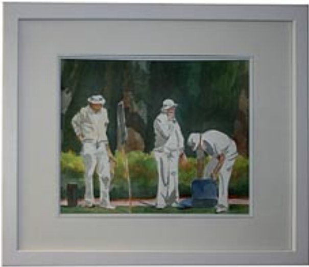
“Setting Up” by Lydia Velarde