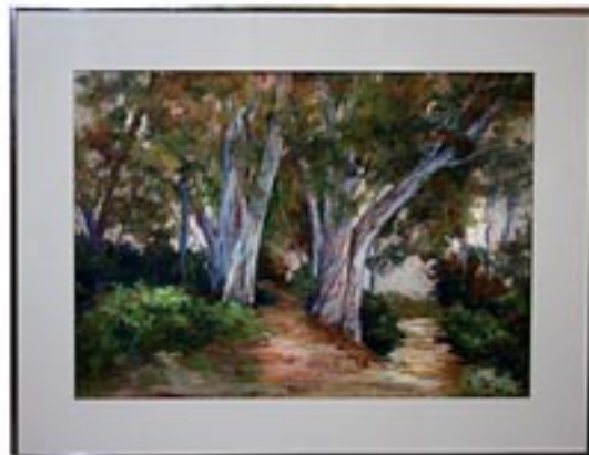
"Batiquitos Eucalyptus" by Joan Grine