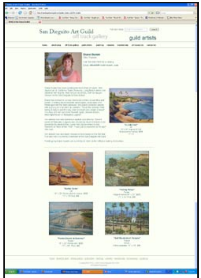
This is a sample of the Individual Page that is available for SDAG members for a set up fee of $25.